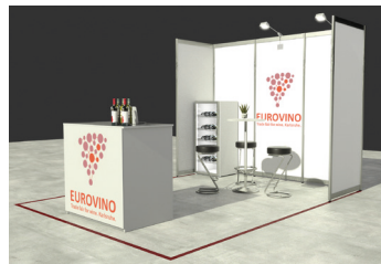
Stand example 12 m 2 Magnum