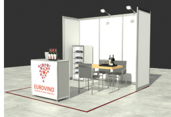
Stand example 12 m 2 Piccolo