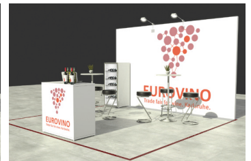
Stand example 16 m 2 Impériale