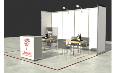
Stand example 16 m 2 Piccolo