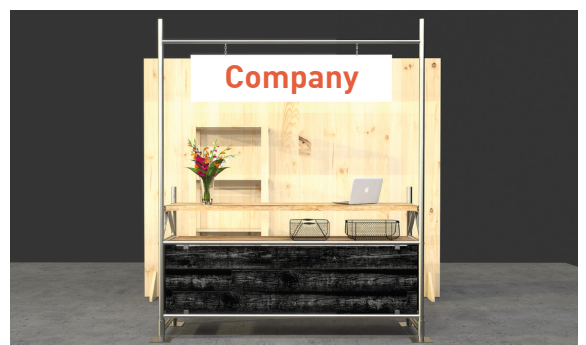
Stand example – decoration is not included in the package.

Please send your logo as a file (in eps format or as a print-ready jpg) to the following e-mail address: service@eurovino.info