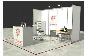
Stand example 16 m 2 Magnum