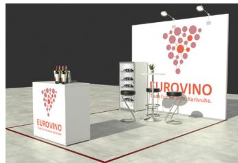
Stand example 12 m 2 Impériale