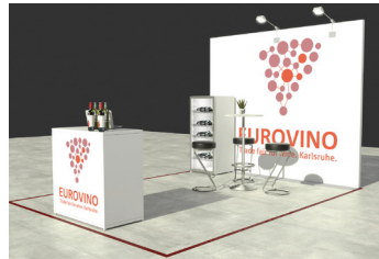
Stand example 12 m 2 Impériale