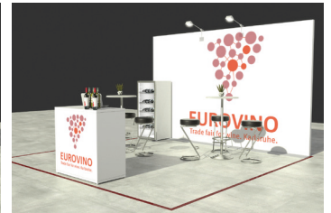
Stand example 16 m 2 Impériale