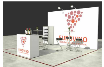
Stand example 16 m 2 Impériale