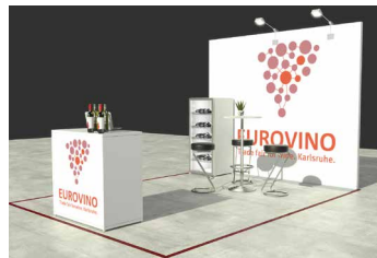
Stand example 12 m 2 Impériale