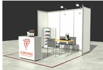
Stand example 12 m 2 Piccolo