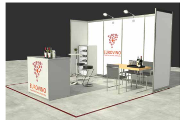
Stand example 16 m 2 Magnum