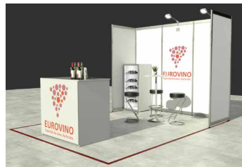
Stand example 12 m 2 Magnum