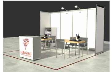
Stand example 16 m 2 Piccolo